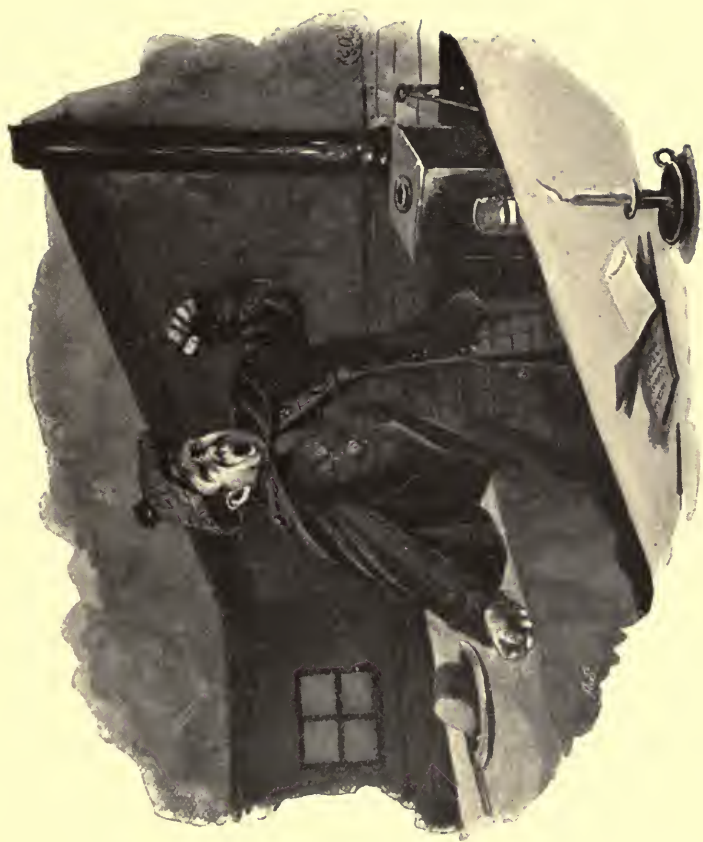
“The speaker permitted to himself a dramatic yawn.”